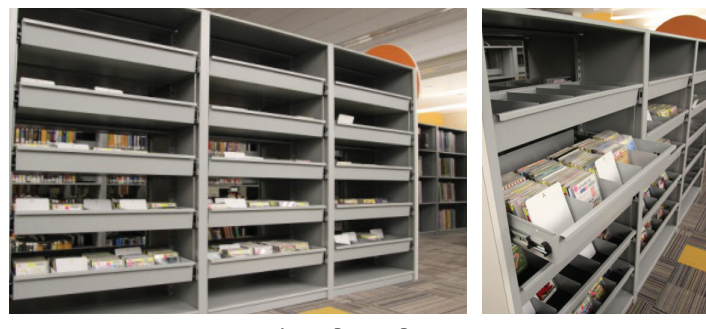
Aurora Browser Boxes