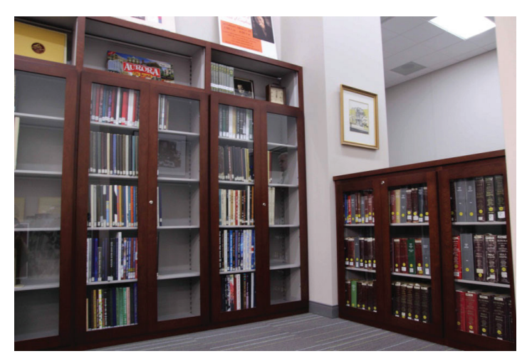
The Geneaology Research Center: Tek-Wood Case Goods

The library's second-floor houses the Genealogy Research Center which contains vast amounts of information on Aurora residents, local buildings and more. Patrons can search the library's database of over 5 billion genealogy records.