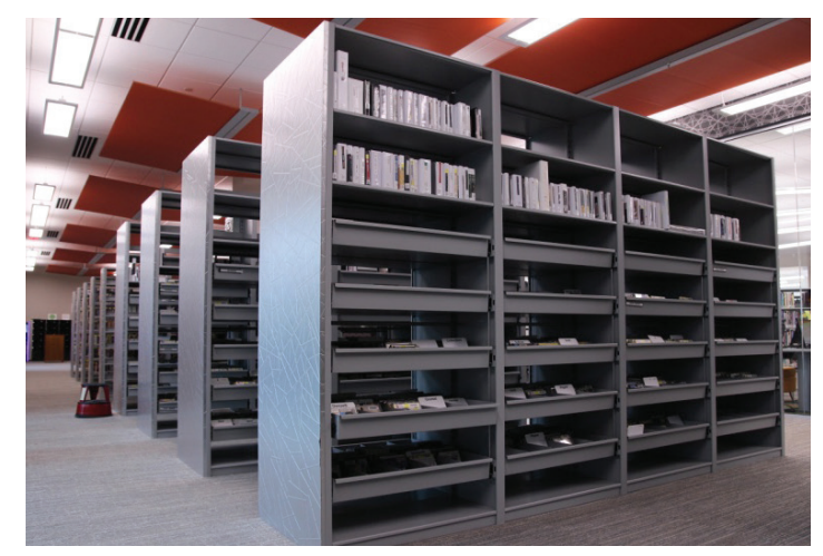
Main Collections Aurora Library Shelving with Laminate End Panels

As part of the planning process, Wolter and Aurora Storage designers engaged the Library staff for their input. The staff was very insistent the book collections not be sacrificed to make way for other features. Books and other collections are still one of the main reasons patrons visit the library. The unique four-post design of Aurora Library Shelving uses on average 20% less floor space than outdated cantilever shelving. This space savings enabled the library to display all of its collections without giving up unique elements the librarians also wanted for the new facility. No other shelving system could have accomplished this task!