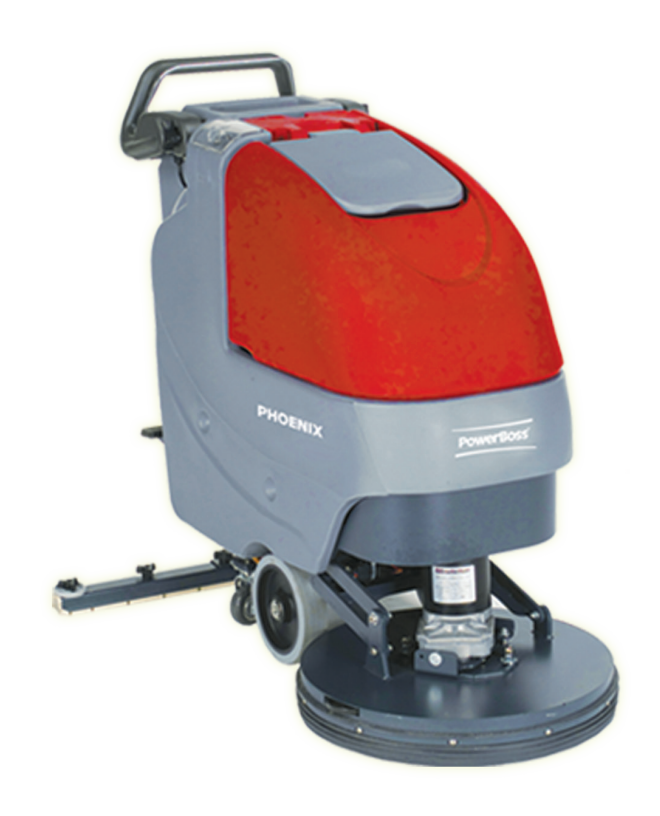
Powerboss Phoenix 20

Another example of how Wolter is more than forklifts and how we "accelerate your productivity" for all your material handling needs.